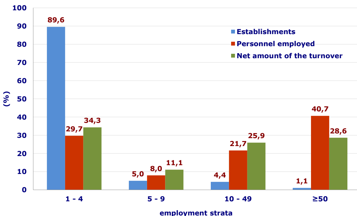
Graph 2. Distribution of the number of establishments, staff employed and turnover figure for professional activities and auxiliary services in the Basque Country by employment stratum. 2013

An analysis according to the size of establishments in the professional activities and auxiliary services sector revealed that micro-enterprises (with fewer than 10 employees) comprised 94.6% of establishments and generated 45.4% of total turnover with 37.7% of the employed personnel. Small companies (with 10 to 49 employees) represented 4.4% of establishments with 21.7% of employment, and 25.9% of the turnover. Finally, companies with 50 or more employees (medium and large companies) generated 28.6% of total turnover, provided employment to 40.7% of people in work and represented 1.1% of all establishments.