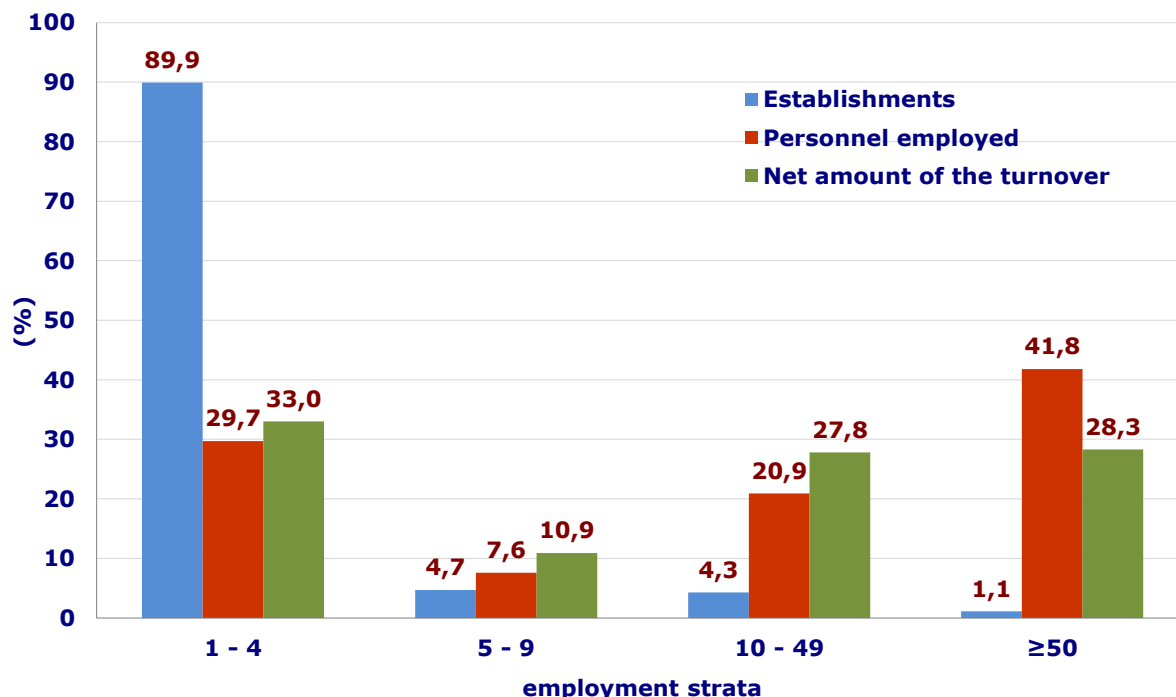
Graph 2. Distribution of the number of establishments, staff employed and turnover figure for Professional Activities and Auxiliary Services in the Basque Country by employment stratum. 2014